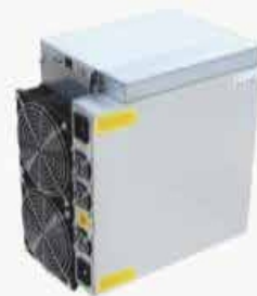
BITMAIN ANTMINER S17+