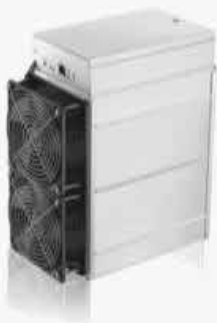
BITMAIN ANTMINER Z11