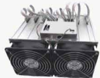
DAYUN ZIG Z1 PRO